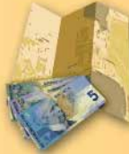
Local maps (identify a family meeting place) and some cash in small bills