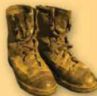
Seasonal clothing and footwear