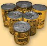
At least a three-day supply of non-perishable food. Manual can opener for cans